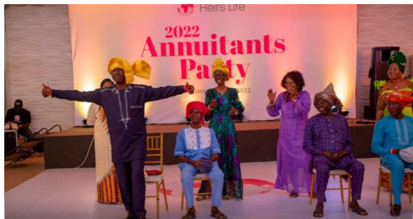
Retirees having a great time at the 2022 Heirs Life Annuitants' Party