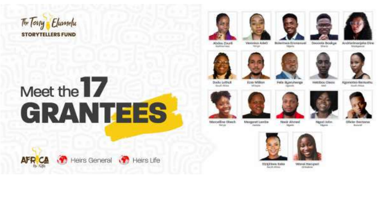
Heirs Insurance Group Sponsors 17 Creatives Across Africa through the Tony Elumelu Storyteller's Fund Initiative