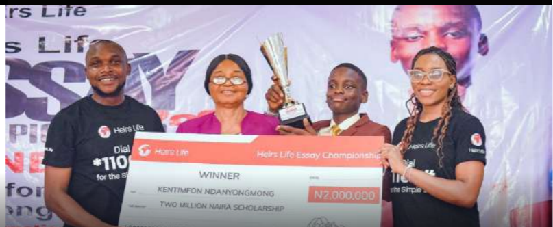
14-Year-Old Wins N2 million scholarship at the 2023 Heirs Life Essay Championship