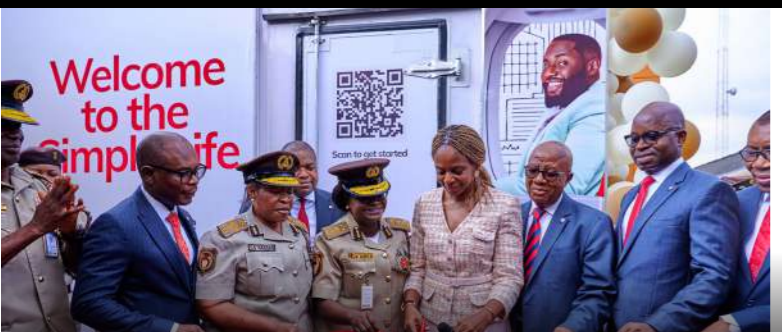
Heirs Insurance Group Donates Solar Power Station to Lagos Passport Office to Boost 24hr Passport Production