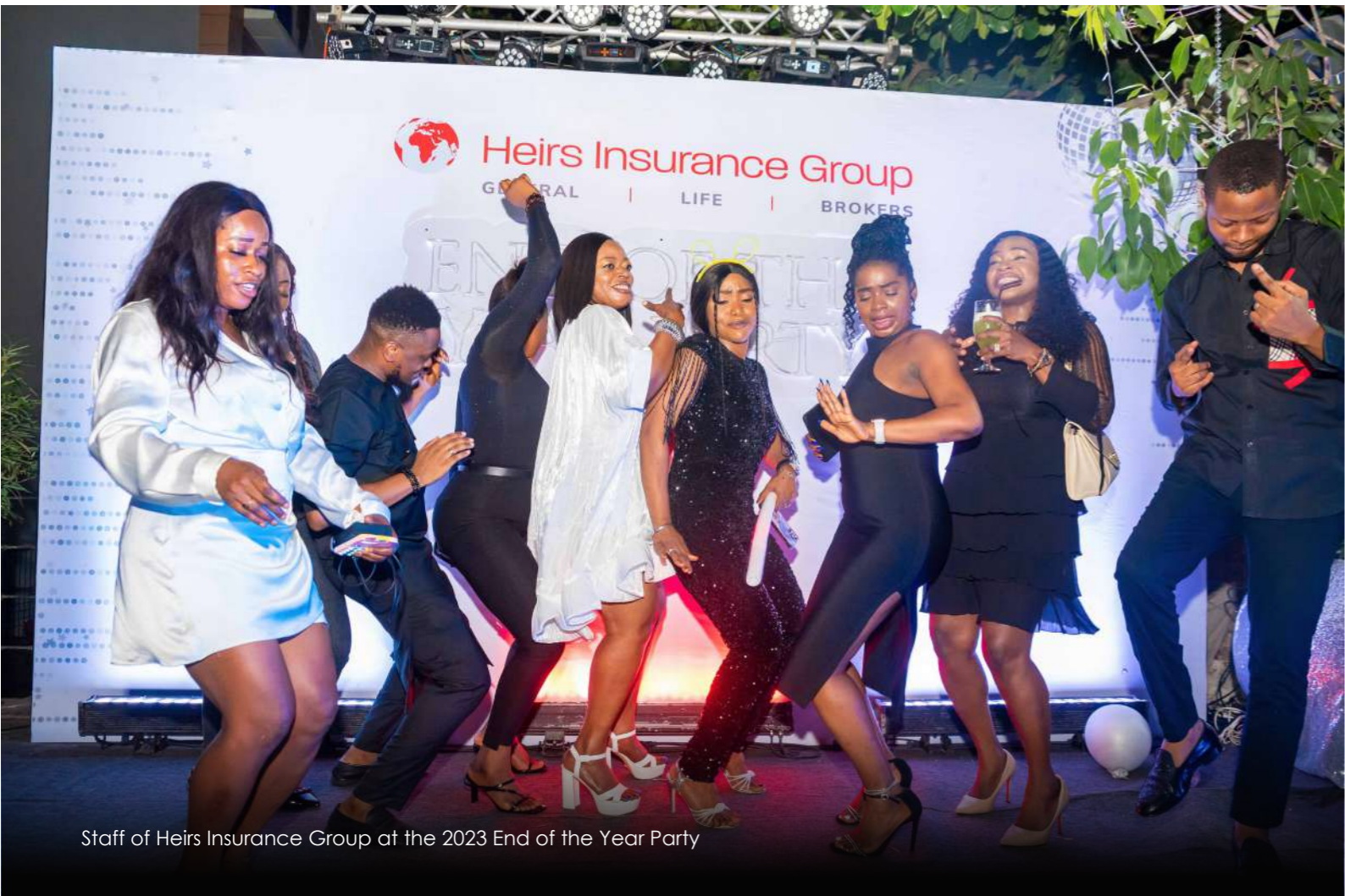
Staff of Heirs Insurance Group at the 2023 End of the Year Party